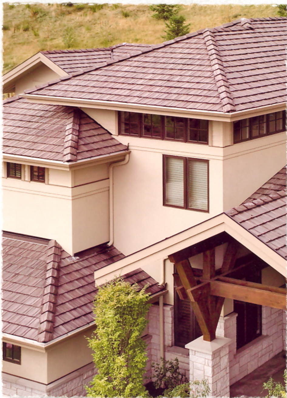
MonierLifetile Madera Vintagewood