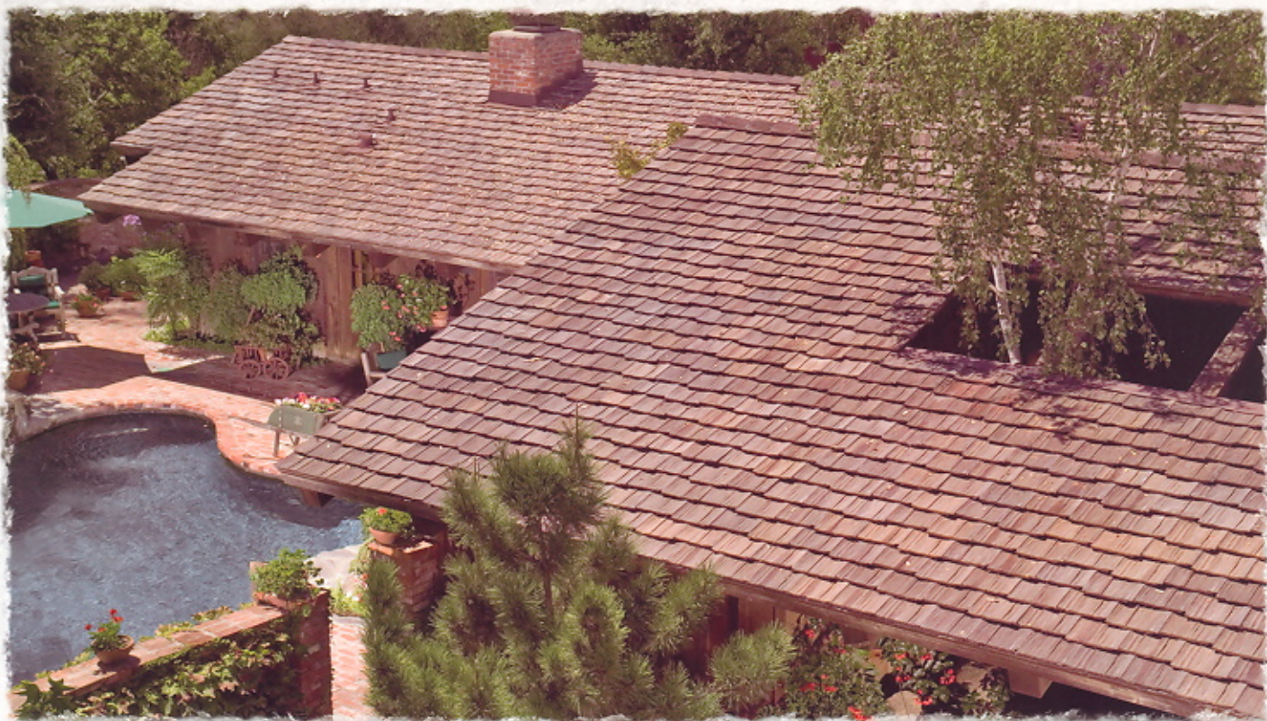
MonierLifetile Madera Autumnwood