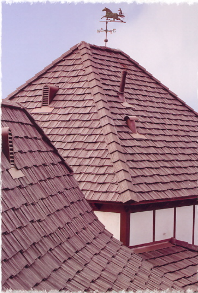
MonierLifetile Madera Mountainwood