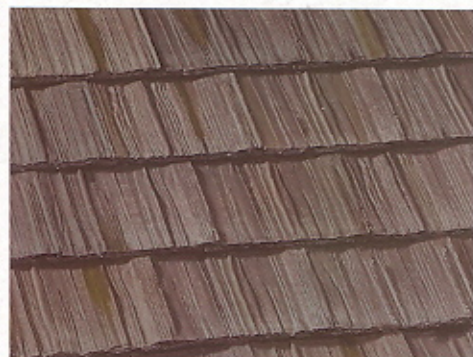
Mountainwood 1MDCL5001 90° Rake 19CCL5001 V-Ridge 1VCCL5001 Tapered Eave Starter 1CECL5001