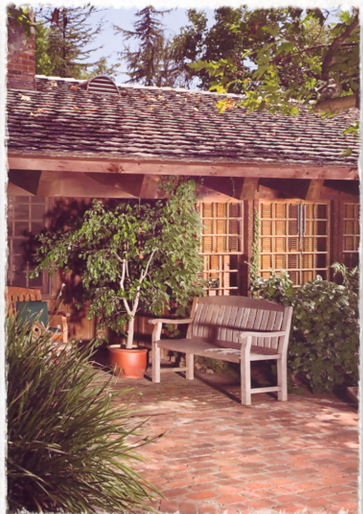
MonierLifetile Madera Autumnwood