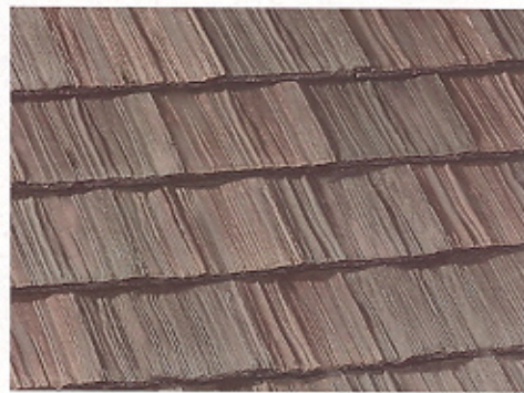
Vintagewood 1MDCL5011 90° Rake 19CCL5011 V-Ridge 1VCCL5011 Tapered Eave Starter 1CECL5780