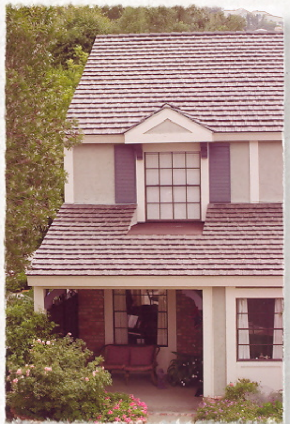
MonierLifetile Madera Vintagewood