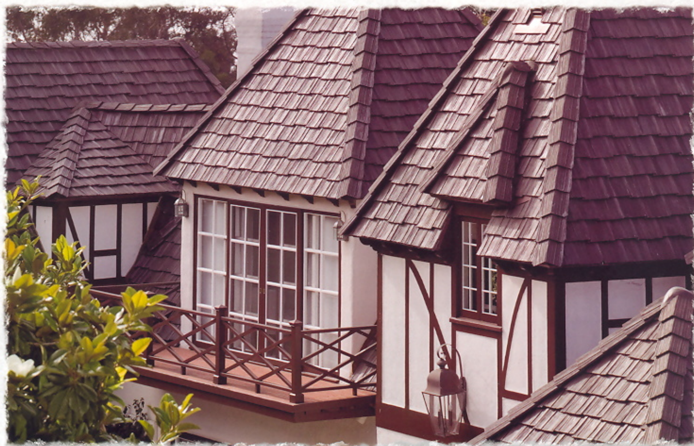
MonierLifetile Madera Mountainwood