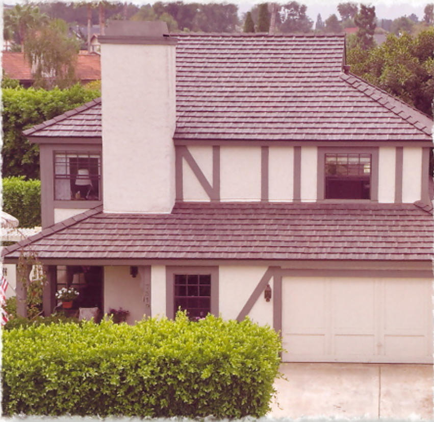
MonierLifetile Madera Autumnwood